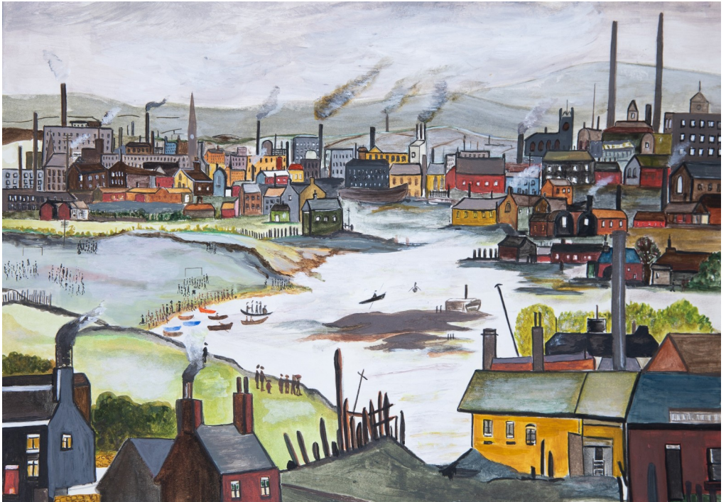
Painted by Su (reproduction of work by LS Lowry)