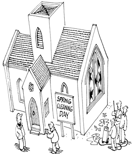
...er... the good news is the youth-group have made a great start by pressure-washing the west window...