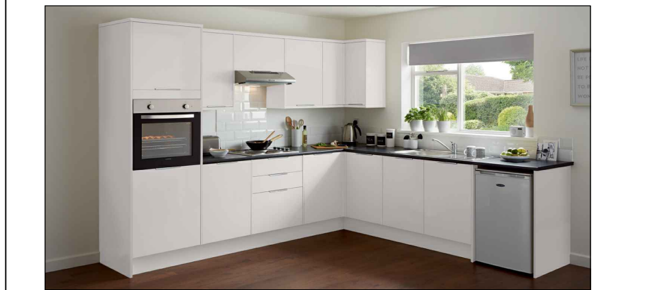
Option 2 Contract Kitchen