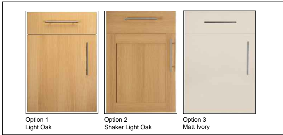
DOOR FINISH OPTIONS NTS